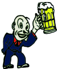
POUR MAN'S PUB AND GRILL Sullivan, WI.