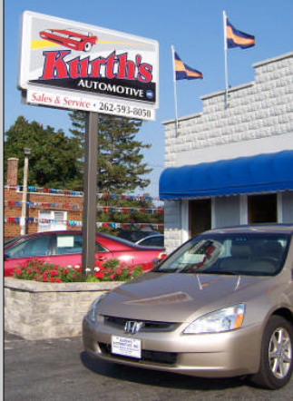
Kurth's Automotive Inc